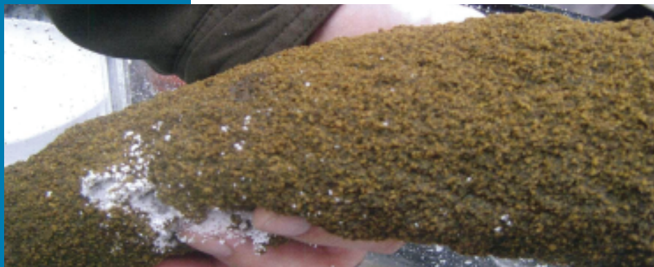
Crude Oil on Saltwater