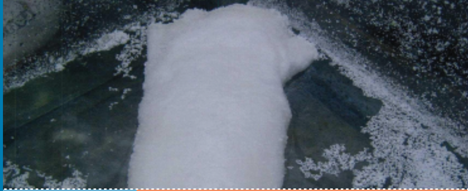
Gasoline on Salt Water